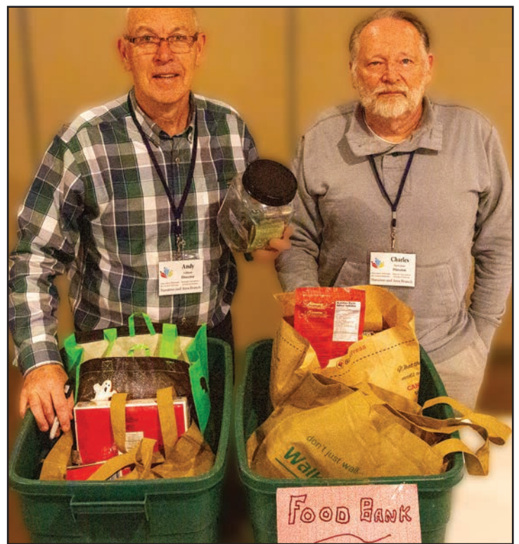
We collect donations (food or money) for the local Food Banks at each meeting. There will be a Collection Box at the Registration Desk to receive your gifts.

A nice, calm and respectable lady went into the pharmacy, right up to the pharmacist, looked straight into his eyes, and said, "I would like to buy some cyanide." The pharmacist asked, "Why in the world do you need cyanide?" The lady replied, "I need it to poison my husband." The pharmacist's eyes got big and he exclaimed, "Lord have mercy! I can't give you cyanide to kill your husband! That's against the law! I'll lose my license! They'll throw both of us in jail! All kinds of bad things will happen. Absolutely not! You CANNOT have any cyanide!" The lady reached into her purse and pulled out a picture of her husband in bed with the pharmacist's wife. The pharmacist looked at the picture and replied, "Well now. That's different. You didn't tell me you had a prescription."