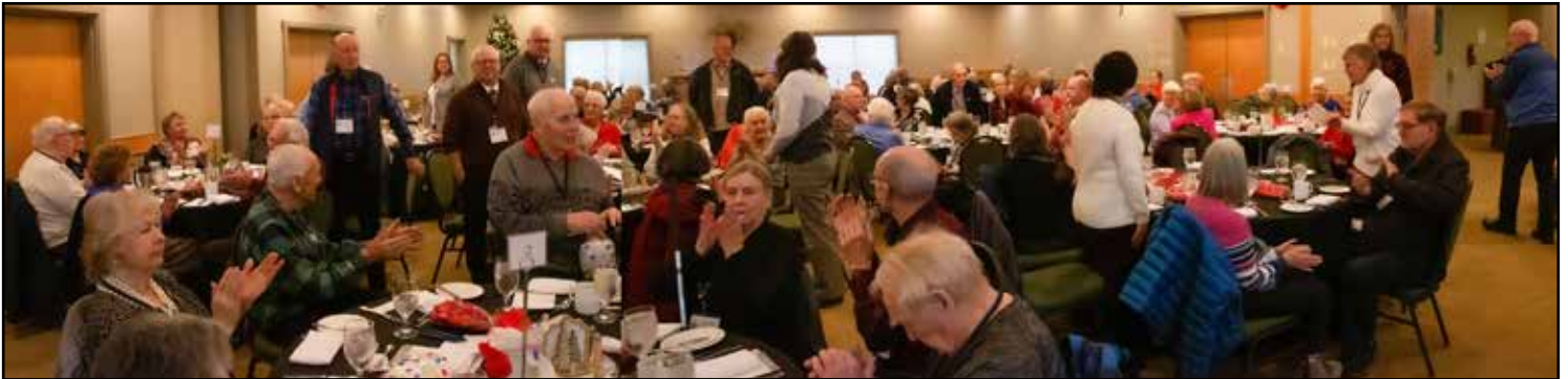
November Meeting 2023, Tigh-Na-Mara, Parksville