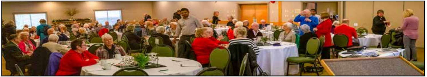
November 2022 meeting at Tigh Na Mara