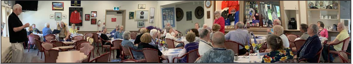
Volunteer Luncheon held May 25, 2023 provided training and socialization plus a great dinner.