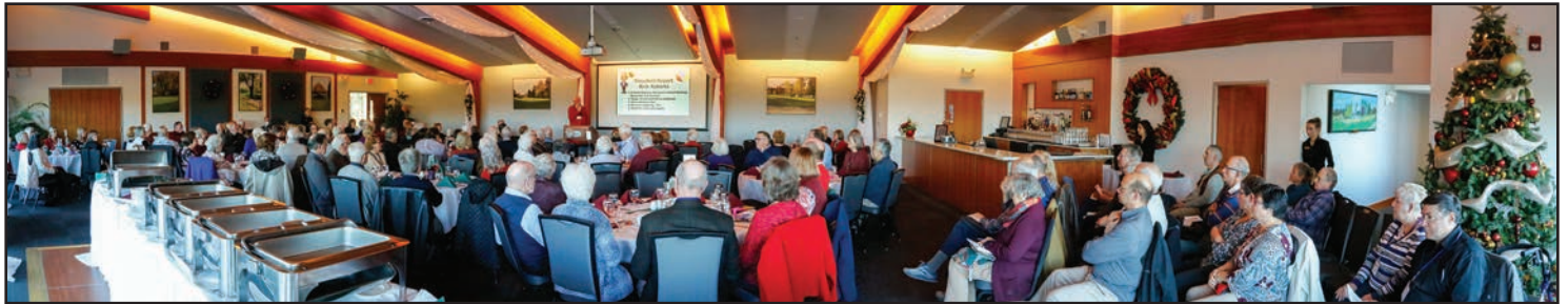
November 28 Meeting at the Nanaimo Golf Club, 119 attendees.