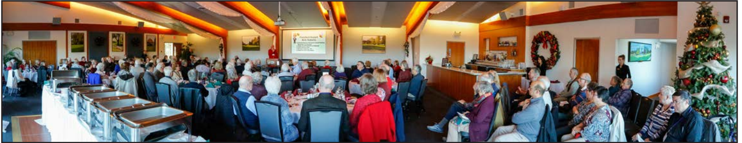
November 28 Meeting at the Nanaimo Golf Club, 119 attendees.