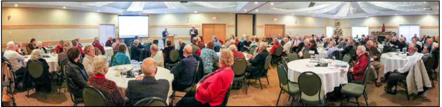
November 19, 2015 General Meeting held at Tigh-Na-Mara, Parksville - 130 attendees