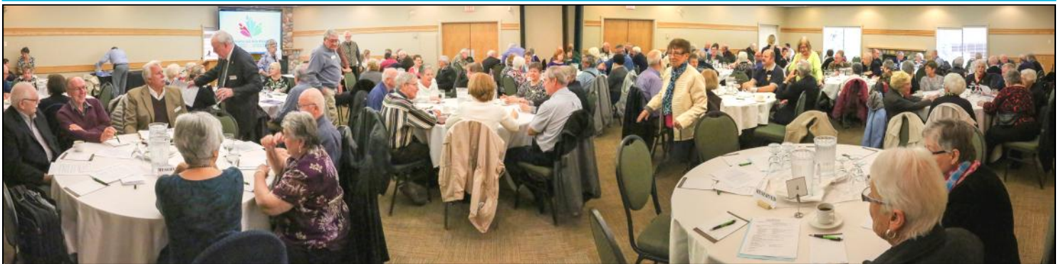
Annual General Meeting in March at Tigh Na Mara Resort, Parksville