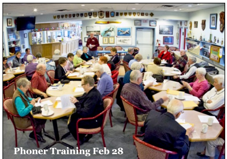
Phoner Training Feb 28