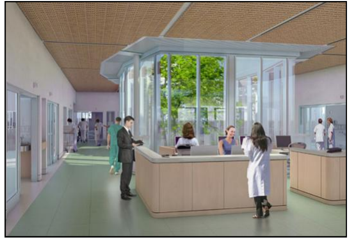
Artist rendering of the completed expansion of the Emergency Department

Construction has already begun on a major expansion which will more than double the existing space. This $36.9 million project is mostly funded through the BC government, Regional District of