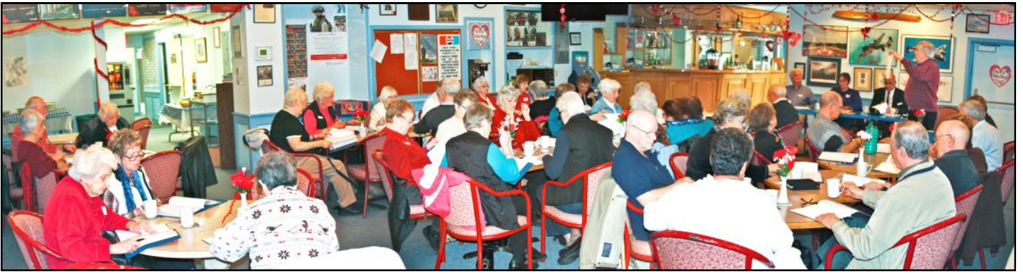
Volunteer phoners turned out for the phoner training session at Legion #257