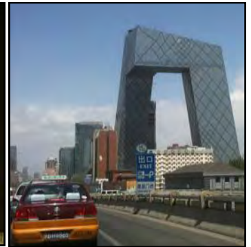
Corner of Forbidden City CCTV Tower in Beijing