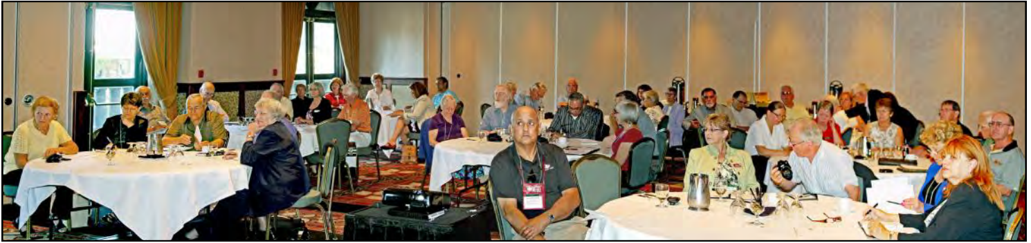
Presidents from the 15 BC Branches, Provincial Advocacy Officers, Territory Advocacy Officer, RSOs and ND