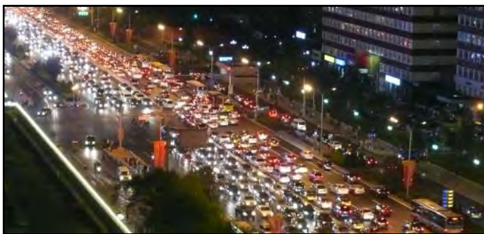
Traffic scene taken from Bill's Apartment

Bill used cars to explain the Chinese thirst for natural resources. In Beijing, there are 1500 new car registrations per day or 45,000 new cars each month requiring fuel and infrastructure.