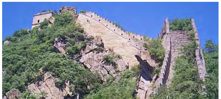
The great wall of China