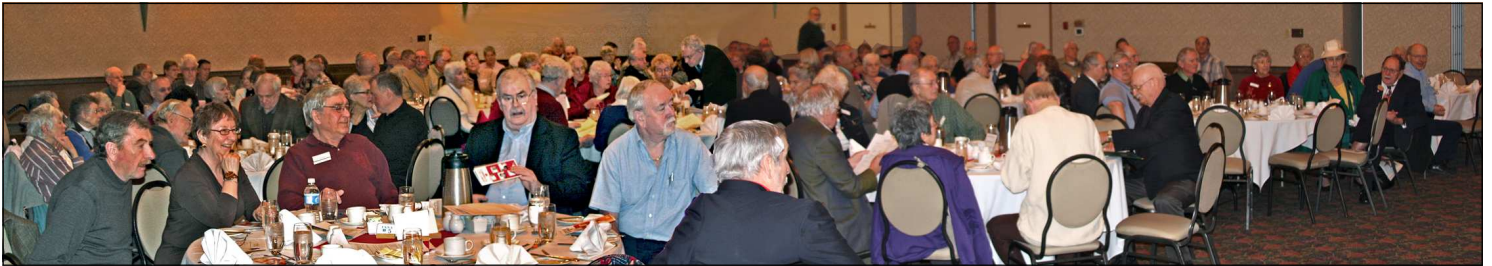
FSNA Meeting, March 24, 2011 at the Coast Bastion Inn, Nanaimo